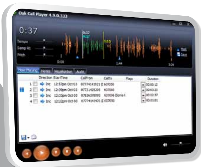
Play - Review calls visually within Oak's media style call player.

Oak in conjunction with Voxsmart have done a seamless integration to record Blackberry devices directly onto the recordX platform. A single user interface allows all call types to be viewed and played.